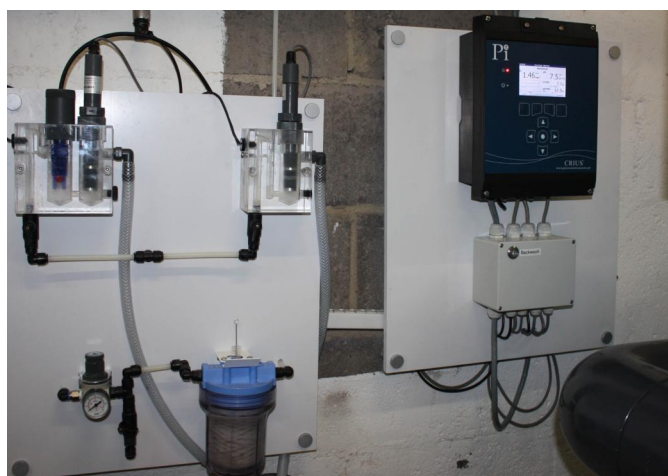
Fig.3 - A picture of one of the CRIUS® controllers installed at Crow Wood Leisure.

Crow Wood Leisure in Burnley, UK is a high quality, private leisure facility running a number of pools and spas. In a drive to increase bathing water quality and to reduce CO 2 emissions, Crow Wood installed two CRIUS® pool controllers (fig.3) in 2008.