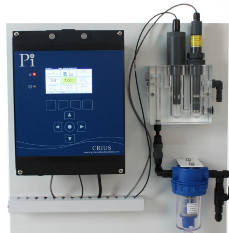
Fig.1 - An example of a CRIUS® AquaSense pool controller

The second control mechanism is based on the control output from the controller to the chlorine dosing pump. During normal pool usage there will be times when the pool is almost empty and during these times we want to turn the pump down, and during times of heaviest pool use we want to turn the pumps up again.